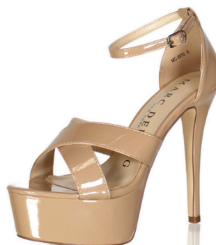
Teen Miss, Miss, Ms., Mrs., Elegant Ms.